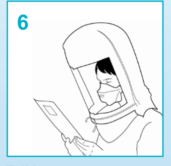
Talking Speak slowly and loudly enough so your fit tester can hear you clearly.