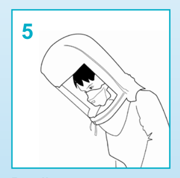
Bending over From a standing position, bend at the waist as if to

Slowly move your head up and down, inhaling when you are facing upwards (towards the ceiling).