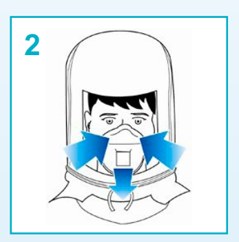
Deep breathing Breathe slowly and deeply.