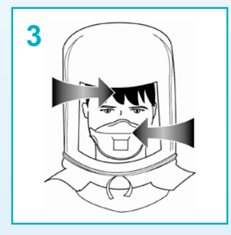
Turning head from side to side Slowly turn your head from

Slowly turn your head from side to side as far as you can. Look over each shoulder momentarily and inhale.