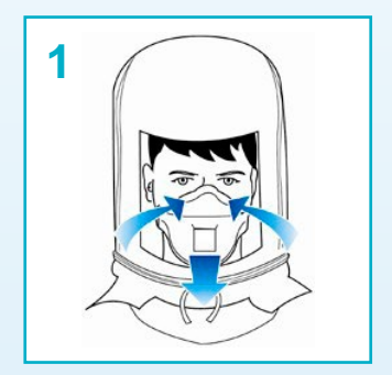
Normal breathing Breathe normally with no head movements or talking.

These exercises simulate some of the stresses that the FFP3 face seal may undergo during your work. You must perform each of the exercises in order to ensure a successful test. Each exercise should last approximately one minute. Breathe through your mouth throughout.